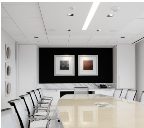
Figure 3. Typical videoconference room, with a T5 fluorescent linear slot luminaire and pairs of recessed LED wallwashers with angled diffusers, located to highlight faces for videocamera transmission.