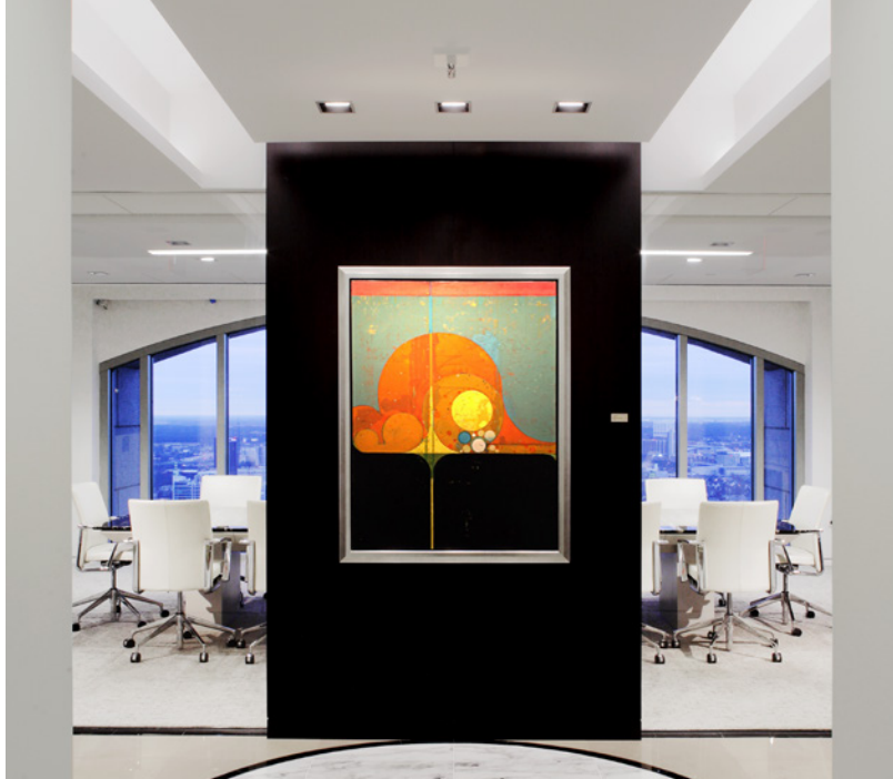
Figure 1. Entry corridor at Alston & Bird, LLP, showing a conference room beyond the art wall. The firm has an extensive art collection, each piece accented by recessed adjustable LED downlights.