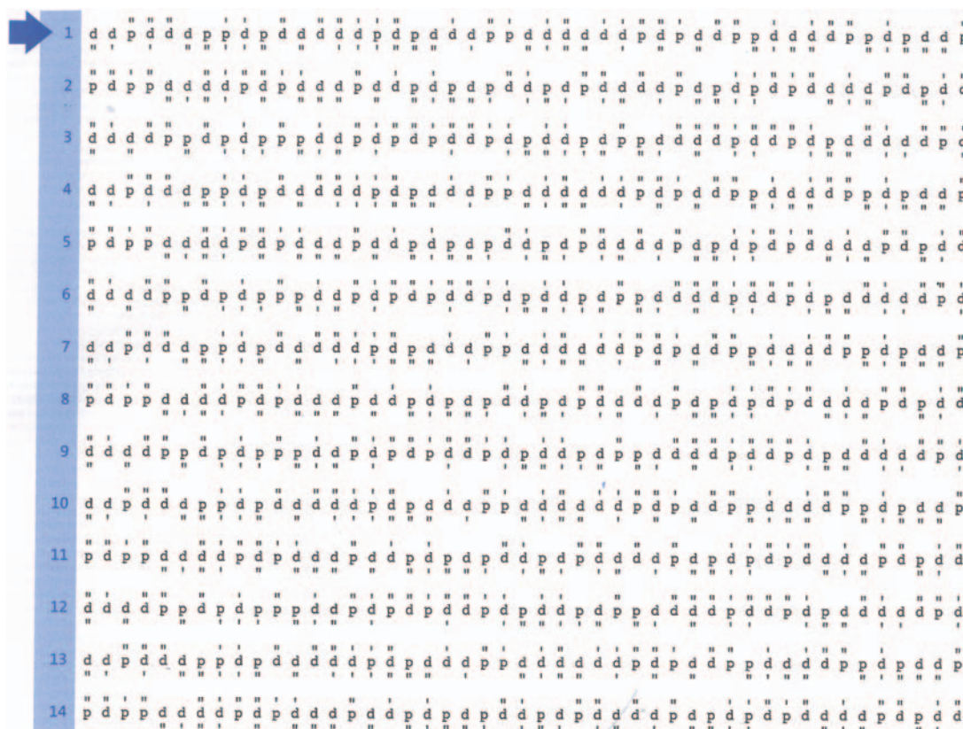
Figure 4 Example of part of the d2-test for measuring concentration

measures design is a sensitive design that reduces sampling error. By comparing pupils' scores on the concentration test at least twice over time and across schools and classrooms, it can be assumed that the variation in individuals' scores will be due to the experimental manipulation of lighting and that any variation that cannot be explained by these manipulations must be due to random factors outside our control. 43