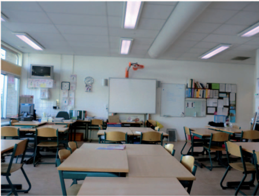
Figure 2 The dynamic lighting system in the focus setting (post-tests)