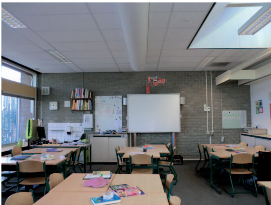
Figure 1 Conventional lighting system in the control school/classroom and the experimental school/classroom (pretest)